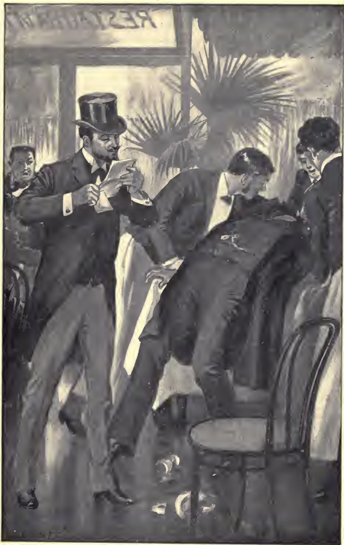
And in fact he did take from the side pocket of the villain a letter which he unfolded and commenced reading aloud.